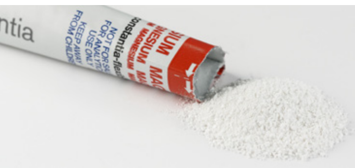
FRUGI with LUX

**APERTA (formerly TOF) is an opening feature that uses microperforation to weaken the PET film without compromising the barrier properties (no damage to the aluminum layer). While easy to open for seniors, both features are difficult for children to open due to the multiple-step approach.