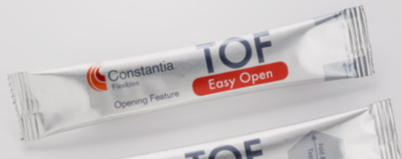
FRUGI with APERTA