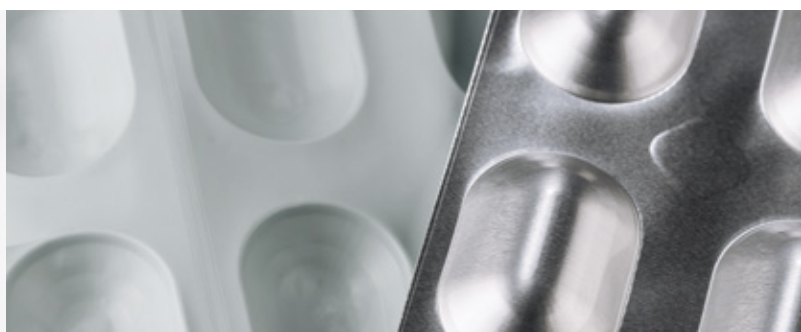
ARIDA protection from the inside and outside of a shaped coldform blister.