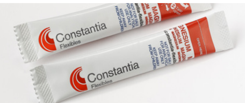
Stick packs are fully compatible for ARIDA protection.